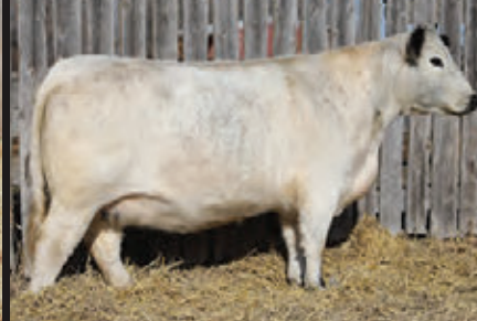
GRAHAM CREEK FARRYN 77F - DAM