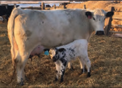
CANDACE CROSSROADS SLB 8C - DAM