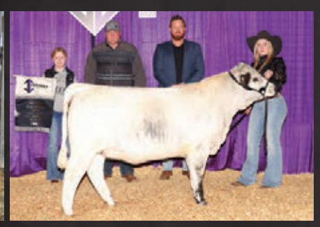
MLM 002K - FULL SISTER