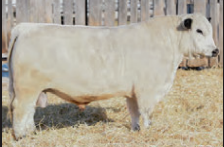
RIVER HILL L11 HORATIO 005H - SIRE

Selling half interest. Contact for terms.