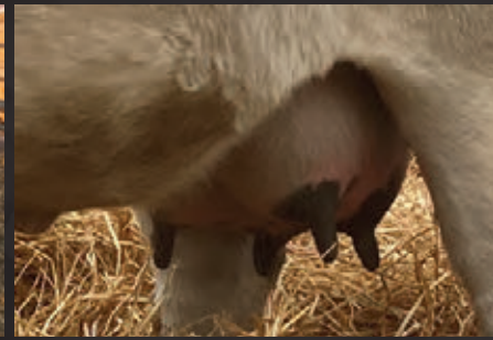
CANDACE CROSSROADS SLB 8C